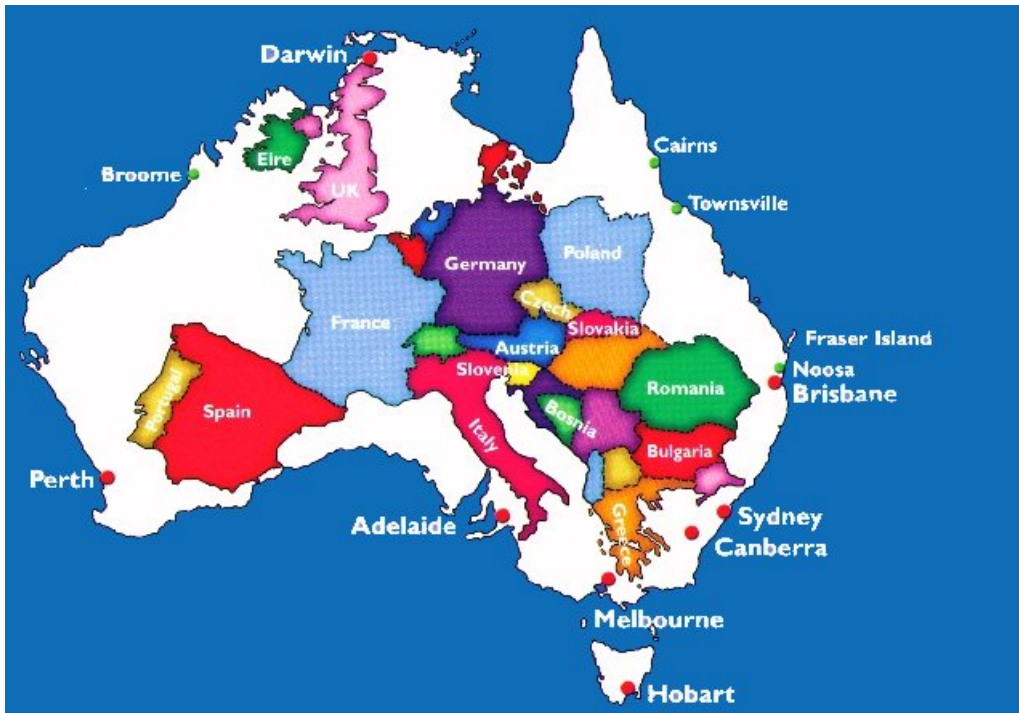
Figure 1: The comparative sizes of Australia and Europe.