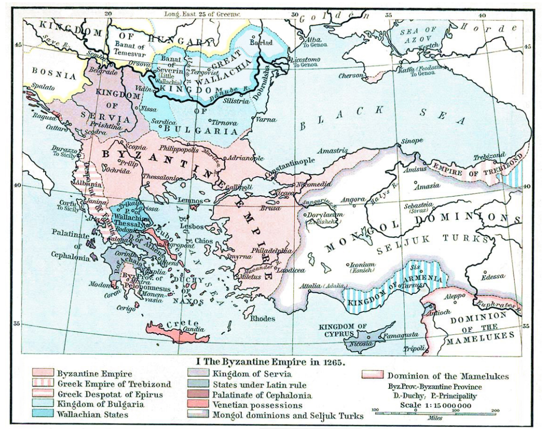
Image 1. The Byzantine Empire in 1265. (William R. Shepherd, The Historical Atlas , New York, 1911, 89.)