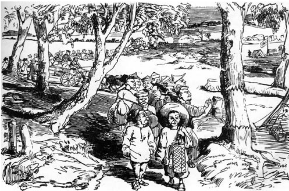
A Flood of Celestial Light pouring in upon the Diggings.

rected groups gave the Chinese an advantage over other miners. 6 In an effort to keep the Chinese out of Victoria, in June 1855 the newly formed colonial government imposed a hefty landing tax of £10 per head and limited the number of Chinese on board each vessel to one person for every 10 tonnes of goods. As entry to neighbouring colonies remained unrestricted, Chinese migrants disembarked at the South Australian port of Robe and trekked overland for 500 miles (a journey of three weeks) to the Victorian gold fields. By 1858 there were an estimated 42,000 Chinese in Victoria.