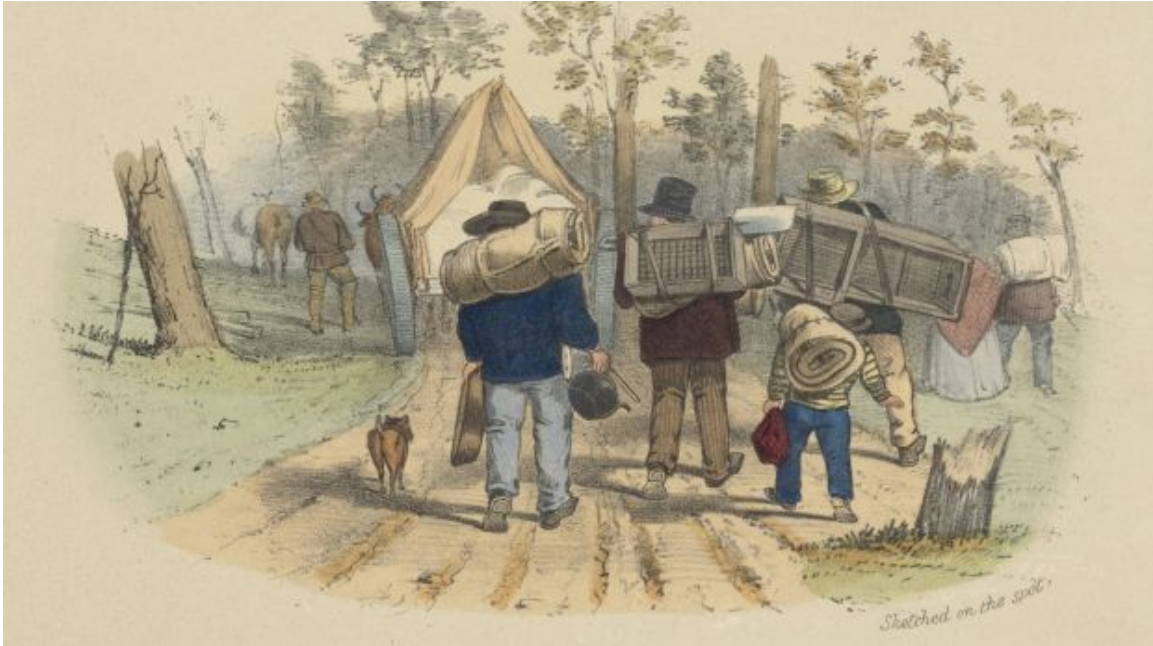
Figure 1: Diggers on the Way to Bendigo ('sketched on the spot'), 1852, by S.T. Gill, lithograph, National Library of Australia. Source: http://nla.gov.au/nla.obj-135671589/view .

grew wider, and more and more discoveries were made. As one area was mined out, diggers shifted to others. Realising that the discovery of gold would benefit the colonies, the government eventually gave Hargraves £10,000 and other gifts as a reward for his “discoveries”.